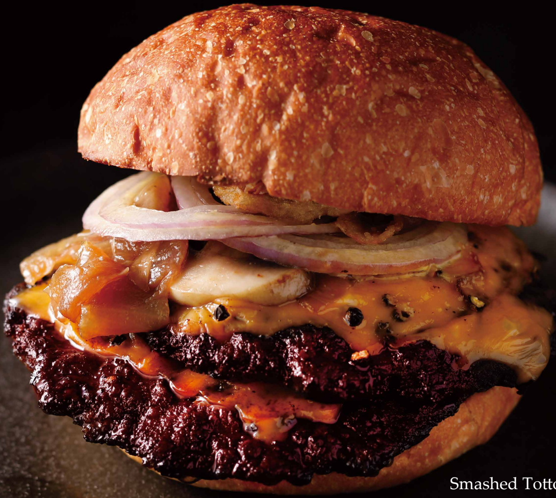
Smashed Tottori Wagyu Burger