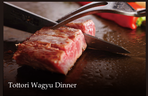
Tottori Wagyu Dinner