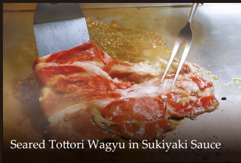
Seared Tottori Wagyu in Suki-yaki Sauce