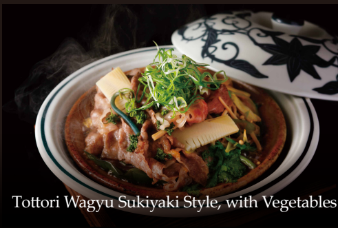
Tottori Wagyu Suki-yaki Style, with Vegetables